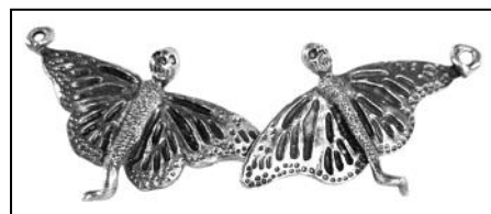
2nd Place: Monarchs of the Dead, Kyra Schon, Bedford (pewter necklace)