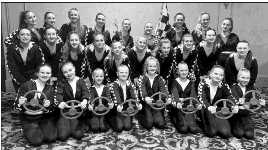
Laurel Arts Performance Company pose at a recent dance competition.