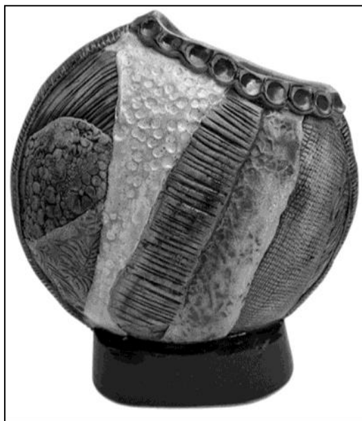
3rd Place: Textured Vessel, Bridget Mayak, Somerset (clay)