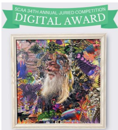
Zone Patcher , Conemaugh, Impression of Indestructible Meditation on Supposed Metamorphosis