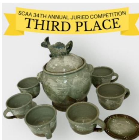
Randy Myers , Somerset, Tureen Set