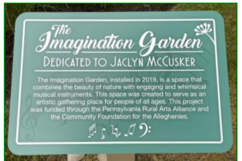
The plaque reads: The Imagination Garden, installed in 2019, is a space that combines the beauty of nature with engaging and whimsical musical instruments. This space was created to serve as an artistic gathering place for people of all ages. This project was funded through the Pennsylvania Rural Arts Alliance and the Community Foundation for the Alleghenies.