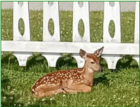
A recent visitor to the art center!

Laurel Arts PO Box 414 Somerset, PA 15501