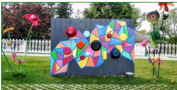
See what our Imagination Garden grows!