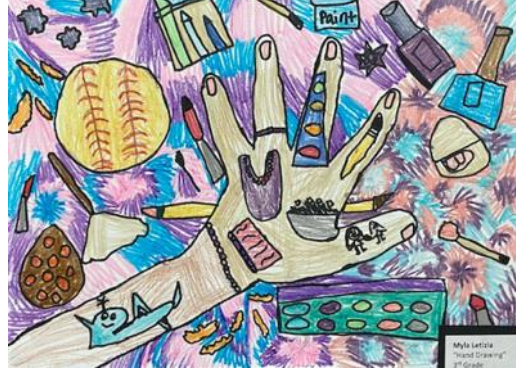
Myla Letizia, Grade 3