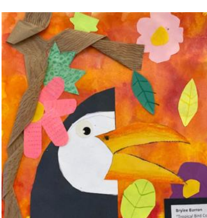
(above) Brylee Barron, Grade 2 (right) Easton Engle, Grade 1