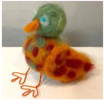
Logan Pyle, Grade 5