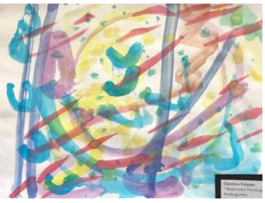
Clarence Palazzo, Kindergarten