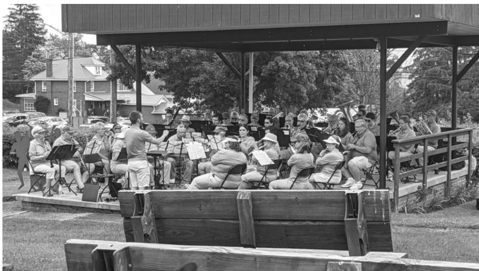
Somerset County Community Band performs its annual Fathers' Day Concert June 20. There's more music to come because ...

Closed Friday-Sunday except for special events.