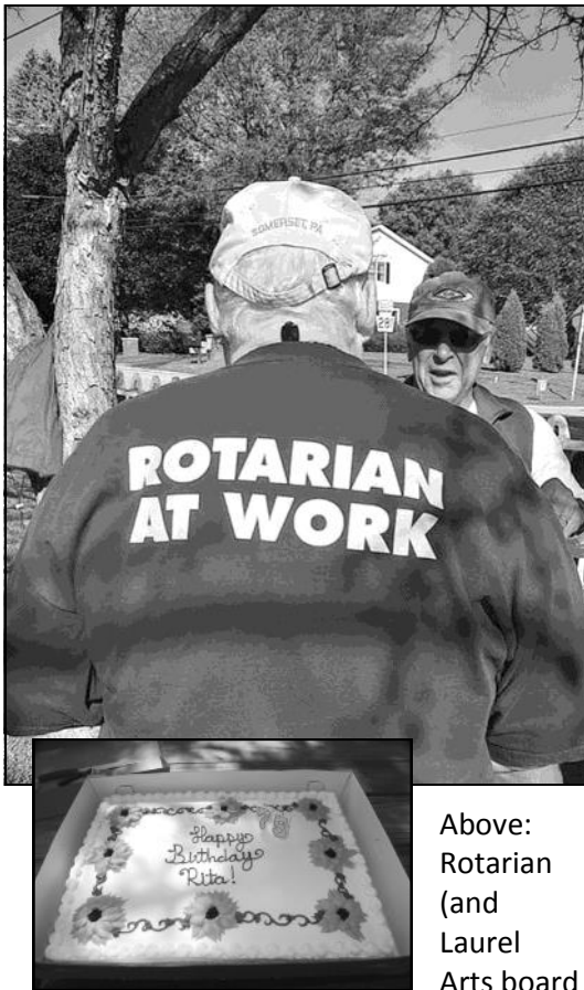
Above: Rotarian (and Laurel Arts board