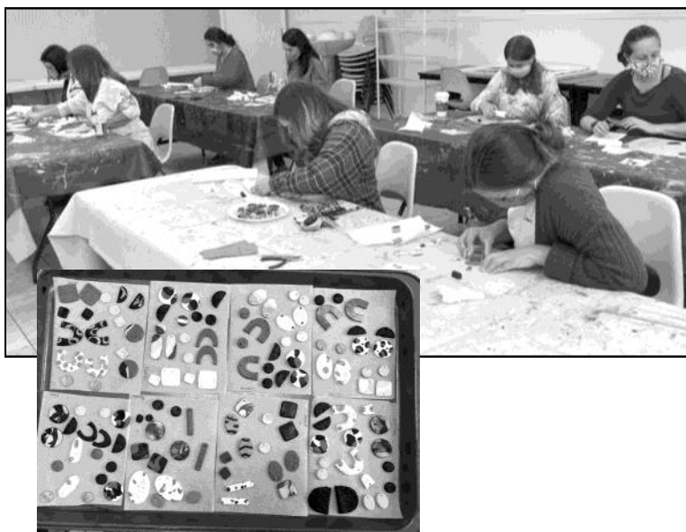
Scarecrow and Snowman reversible sign and lots of colorful clay earrings!