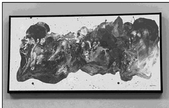
By David Greene

The cyanotype process she often uses was developed in 1842 when photography techniques were being explored and invented. It is a non-silver technique using potassium ferricyanide and ferric ammonium citrate, and when they are mixed together and applied to a surface and dry the surface is light sensitive. Her negatives are the size of the image and placed on the surface of the fabric with a piece of glass on top and exposed to sunlight. The ultraviolet light exposes the image and then it is rinsed in vinegar and water. She tones, dyes, stuffs and embroiders her images.