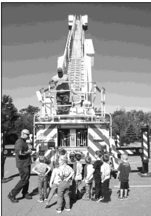
A big thank you to Somerset Volunteer Fire Department for visiting us at Studio Kids.

Purchase tickets at the Education & Dance Center, 601 Georgian Place from 11 a.m. to 6 p.m. Monday through Friday. Call 814-442-6217 for more information.